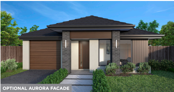
OPTIONAL AURORA FACADE