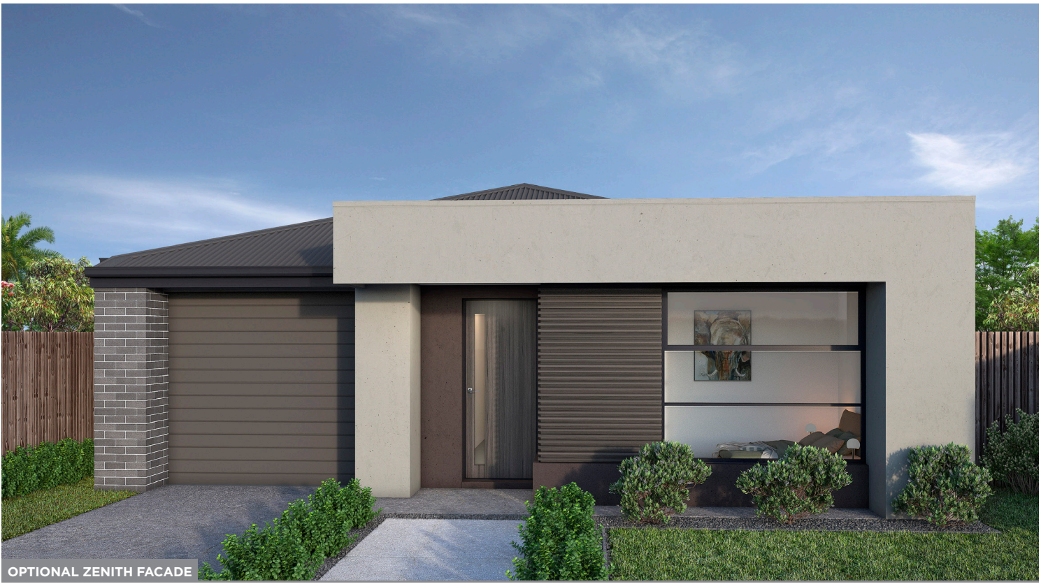
OPTIONAL ZENITH FACADE