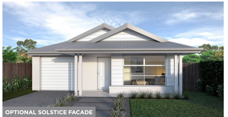
OPTIONAL SOLSTICE FACADE