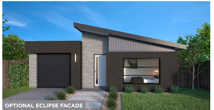
OPTIONAL ECLIPSE FACADE