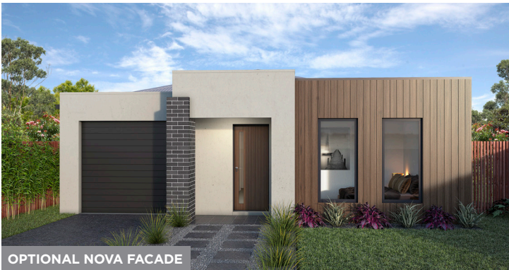
OPTIONAL NOVA FACADE